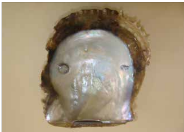
Fig. 3. Monsoon coating of nacre in P1 position.

After a period of 50 days, the implanted oysters were sacrificed and the nacre coated nucleus (mabe pearl) (Fig. 2, 3 & 4) was