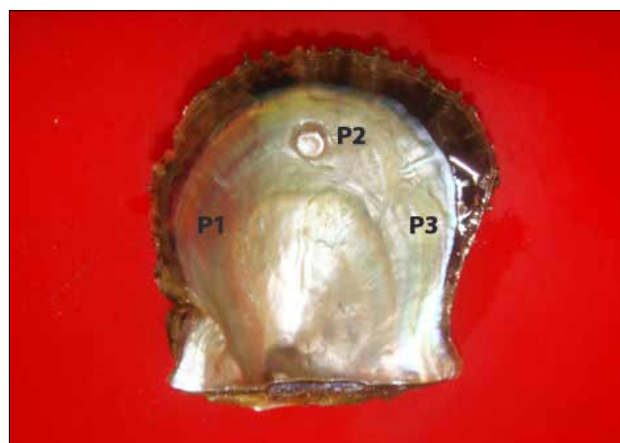
Fig. 2. Post monsoon nacre coating in P2 position, with P1, P2 & P3 positions marked on left valve

Adult oysters were collected and cleaned off fouling organisms before implantation. Right and left shell valves of the oysters were divided as P1, P2 and P3 with corresponding angles of 45° (P1), 90° (P2) and 125° (P3) respectively (Fig. 2). Nucleus used for the present study was prepared using metal templates, by adopting the method developed by Anil et al. (2003). For standardization and replication, flat-circular shaped nuclei were prepared using shell cement material; with a diameter of 5 mm and thickness of 2 mm (Fig. 5) and implanted in both shell valves. Implantation was done following the method described by Anil et al. (2007).