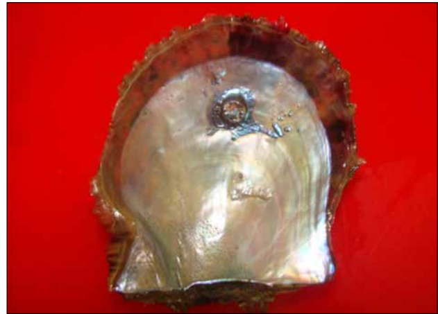
Fig. 7. Pre-monsoon blemish over the implanted nuclei

Previous studies on the seasonal variation in rainfall, salinity, temperature, light penetration, pH, dissolved oxygen content and availability of nutrients from Vizhinjam Bay during one year period of 1977-78 (Dharmaraj et al. , 1980; Appukuttan, 1987) confirms that nutrient values are high during the post monsoon