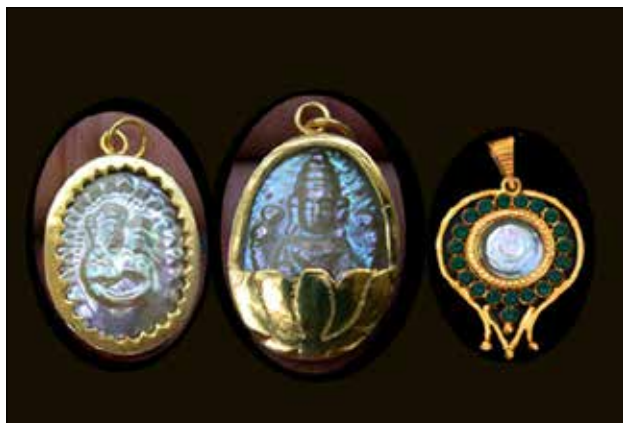
Fig. 1. Different types of image pearls.

pendants, studs, brooches or rings (Anil et al. , 2007) (Fig. 1). They can be made in different size and shapes, but figurines of gods and goddesses covered with natural pearly (nacre coating) are preferred.