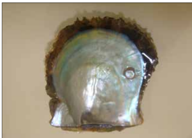
Fig. 4. Monsoon nacre coating in P3 position.